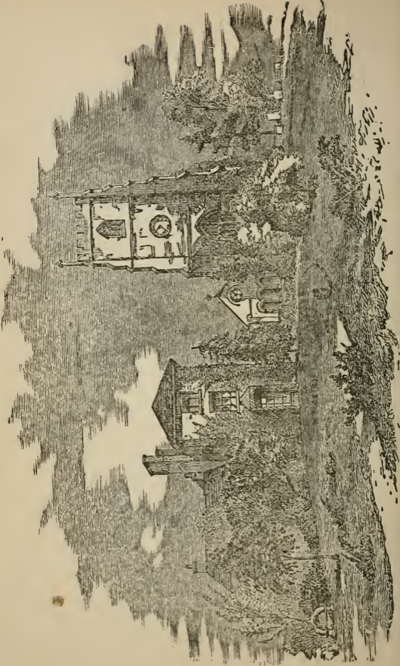
ASTLEY CHURCH AND RECTORY IN 1839